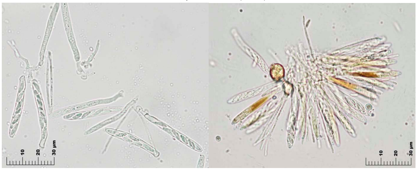
Croziers in water (left) and IKI+ asci (right) (1000x)