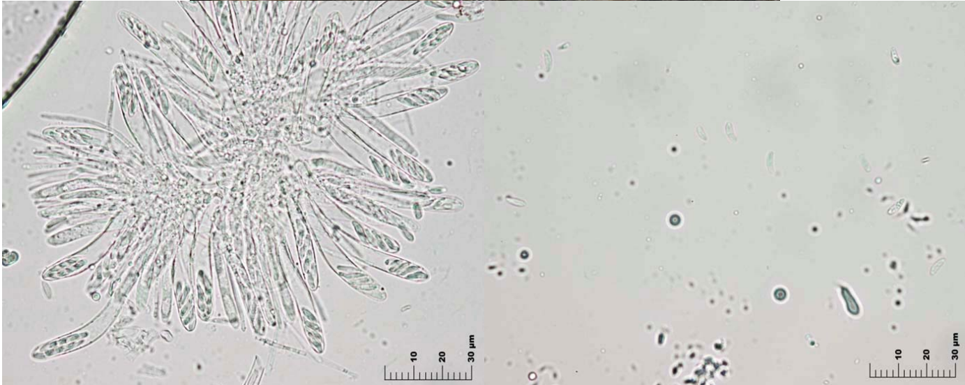
Asci and spores in water (1000x)